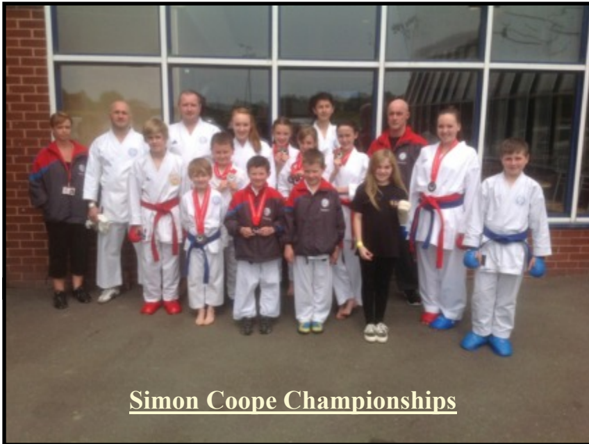
Simon Coope Championships